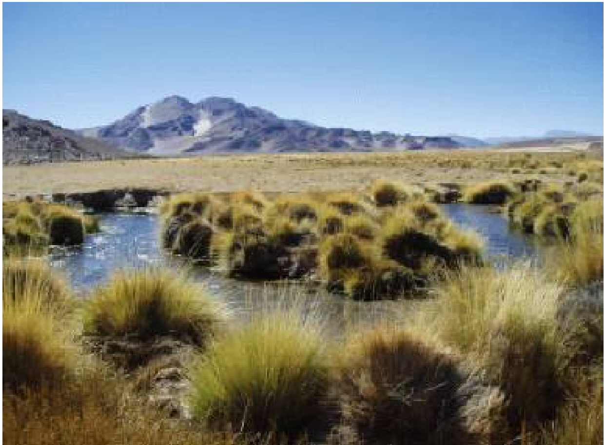
Puna Plateau, Northwest Argentina